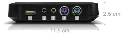
SIDE OF L230